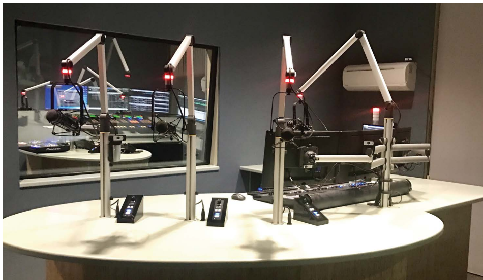
Another view Rancheria Radio's on-air studio, featuring furniture built by the Miwuk tribe from a RadioDNA design.

The production room serves as a backup air studio as well as a mix studio for DJs. The studio console is the Wheatstone IP-12. The IP-12 is a 12-fader control surface that is part of the WheatNet-IP through its IP88CB console audio BLADE engine. Each of its 12 input modules is equipped with an LED source name display and an A/B source selector; sources can be set via a rotary encoder in the master section. This studio also contains a M4 microphone processor